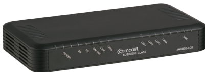
Comcast Gateway Modem

Note: Please place a 911 sticker on your Polycom phone.